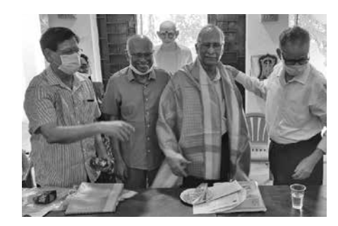
Final EC meeting for outgoing team