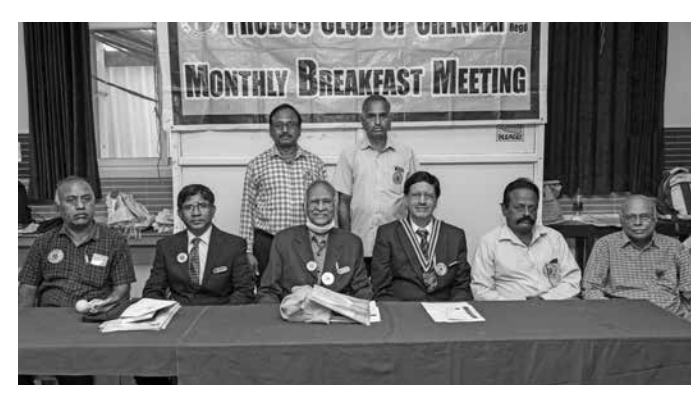
Probus Club Of Cheyyaru Members